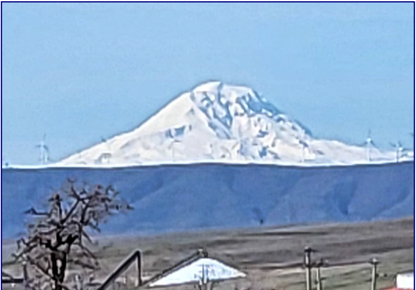
Mt. Adams March 14, 2024

Monday March 11 th started out with mostly clear sky, but only 33° with a light wind. It made it up to 53°, then we had .03 inch of rain late evening. Tuesday started out a few degrees warmer, but only got to 48° with a mix of some sun, some wind, actually a lot of wind up to 30 mph and a bit more rain .01 inch. It was nice and sunny the rest of the week, but still cold nights at 28° - 32°. Clear skies made for nice clear views of the mountains for several days in a row. Our first 70° day was Sunday (72°) for St. Pat's followed by 3 more 70° days.